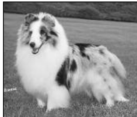
Ch IvanLee CharBar MercyMe IvanLee's second homebred champion