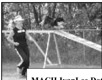
MACH IvanLee Dot Com PT OF