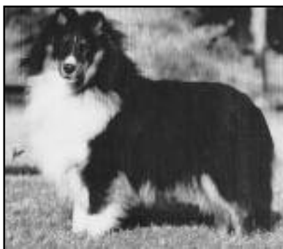
Ch Kylin Hard Copy AX AXJ "Elliot"